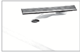
Shown with optional Teak Hidden Drain Cover.