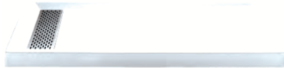
Shown with standard Stainless Steel Hidden Drain Cover.

Low-profile, Multiple Threshold End Drain / Rectangle