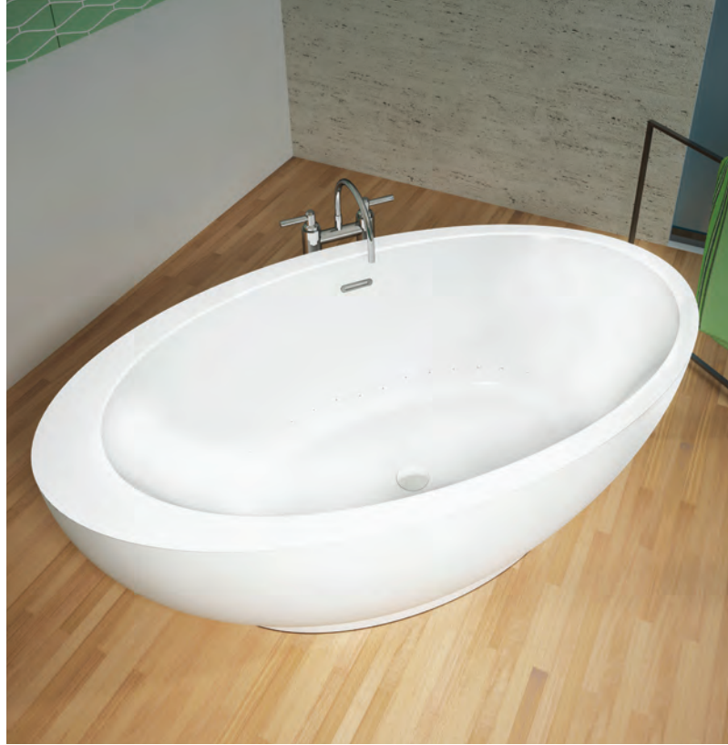
OPALIA 6839 OFF-CENTERED ELLIPSE - RIGHT (FREESTANDING)