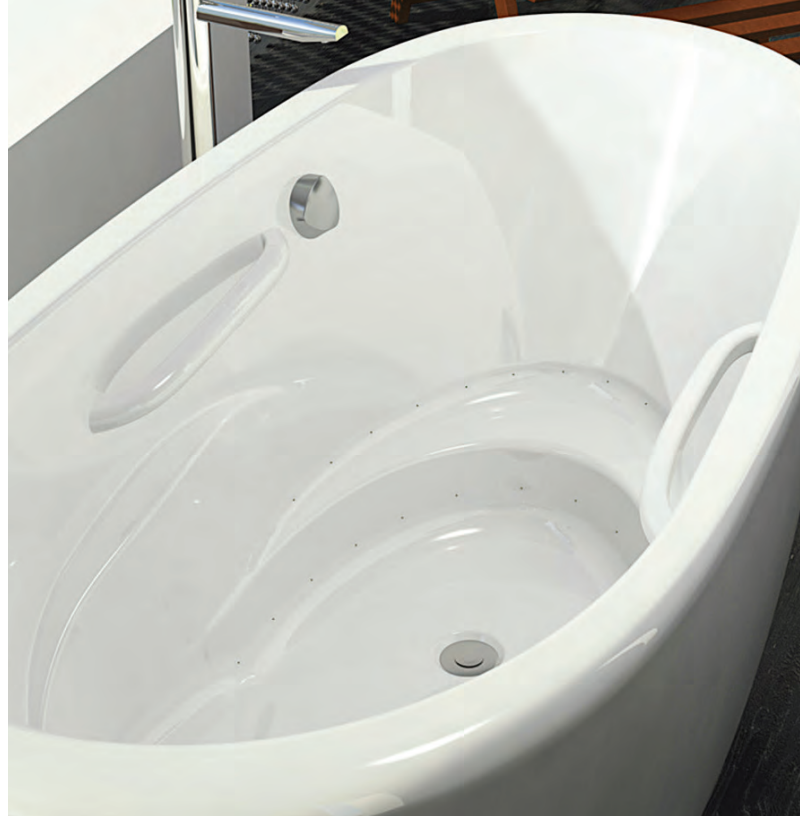
ESSENCIA OVAL 7236 (FREESTANDING)