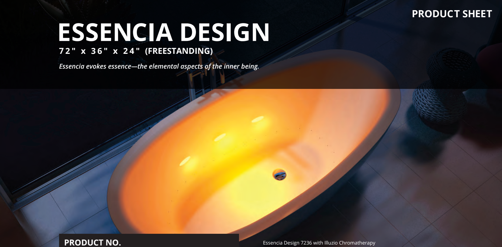
Essencia Design 7236 with Illuzio Chromatherapy

Essencia evokes essence—the elemental aspects of the inner being.