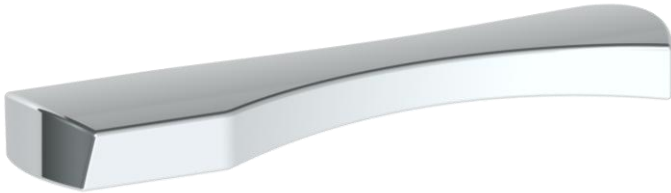
BG4 - JOYCE