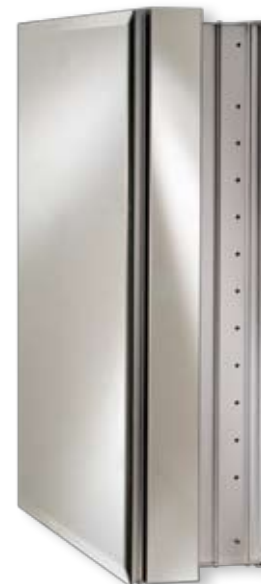
Semi-Recessed 7" Deep 3" outside / 4" recessed Shown in: Bevel