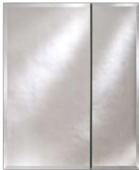
Double Door/ Shown in: Bevel