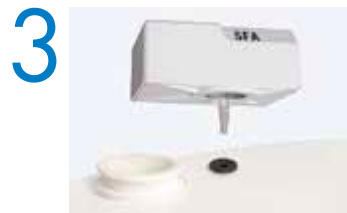
3 Insert the tube and position the Sanialarm on top.