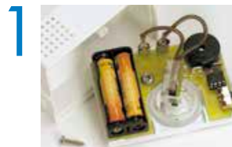
1 Install two AA batteries (not included)

* Suitable for use with Saniplus, Sanibest Pro, Sanipack, Sanigrind Pro and Sanivite