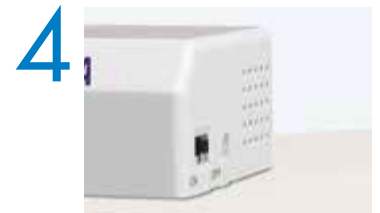
4 Turn the switch to the ON position.