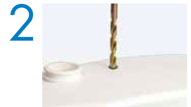
2 Drill a 3/8" diameter hole on top of the case where indicated.