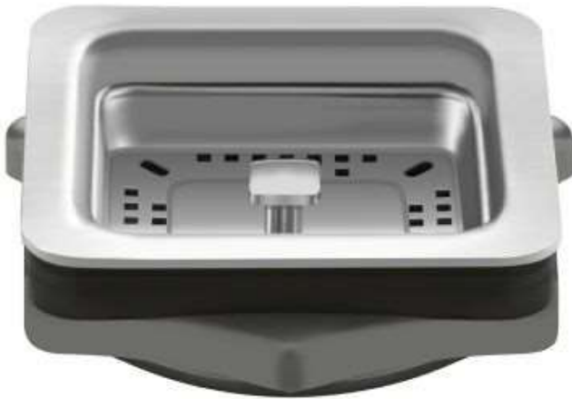
Kraus Exclusive / Model #: GDA-1 Dimensions: 4.5" x 4.5"

Premium Stainless Steel Construction For Maximum Durability