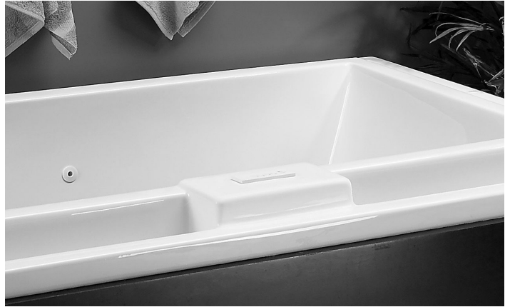
Caribe shown above with single mounting deck.