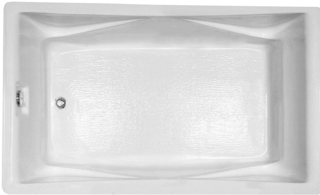
Shown with optional textured bottom.