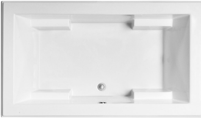
Madelyn 1 features integral armrests.