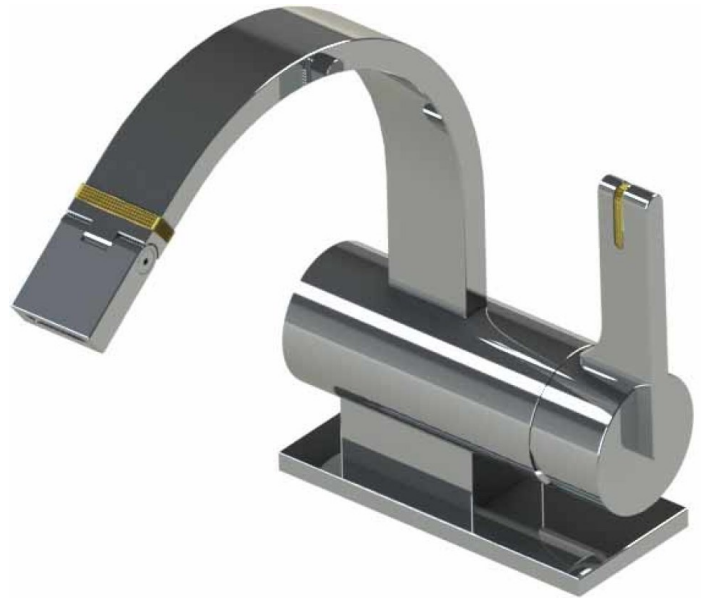
SINGLE HOLE SINGLE CONTROL BIDET FITTING (LESS DRAIN)