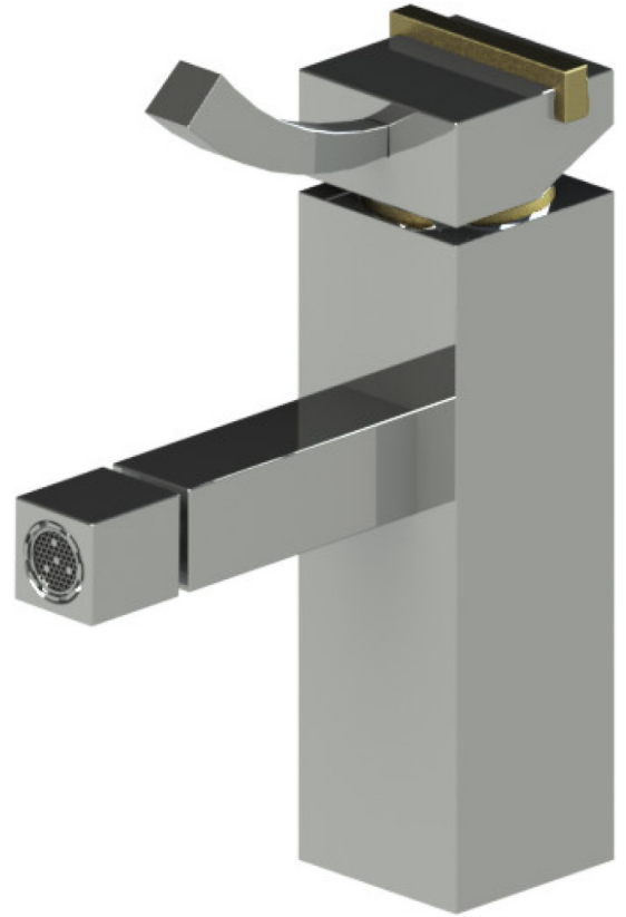
SINGLE HOLE SINGLE CONTROL BIDET FITTING (LESS DRAIN)