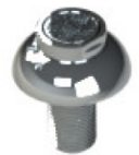
BIDET FITTING WITH SPRAY, DIVERTER, WITH VACUUM BREAKER (LESS DRAIN)