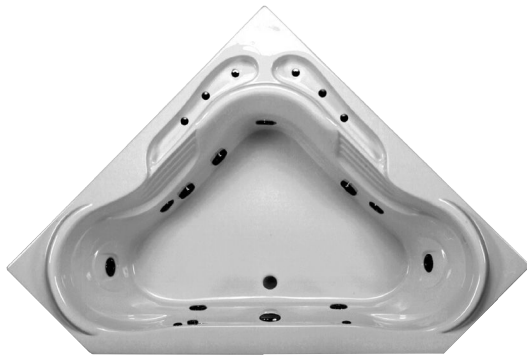
Shown with Standard Whirlpool package and optional Trim Kit.