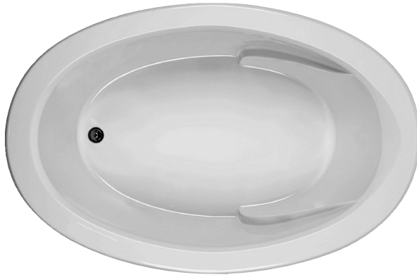
Adena 5 features integral armrests.