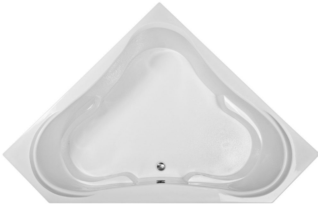
Shown with optional textured bottom.