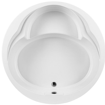
Rendezvous 2 features an integral seat.