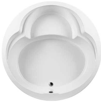
Rendezvous 1 features an integral seat.