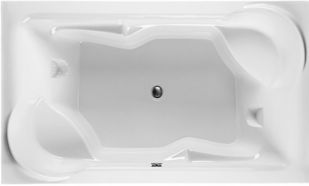
Siesta 1 features integral seats.