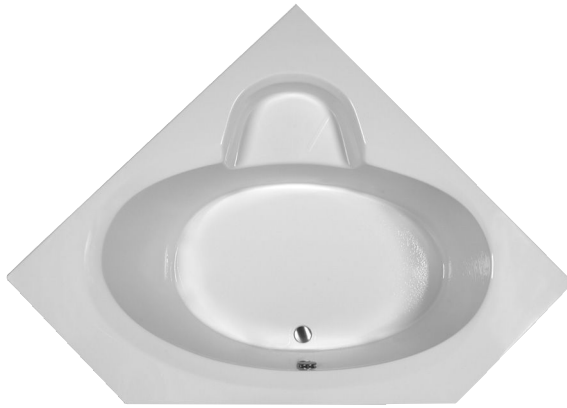
Shown with optional textured bottom.