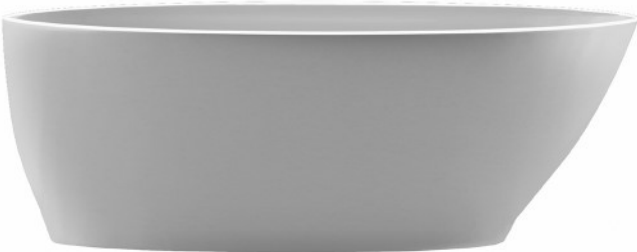
Features an integrated overflow.