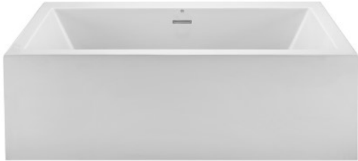
Available as a freestanding model or finished on 1, 2 or 3 sides for various installation applications.

Kahlo 2 with Sculpted Finish® MODEL # 142A 66" x 36" x 22.5"