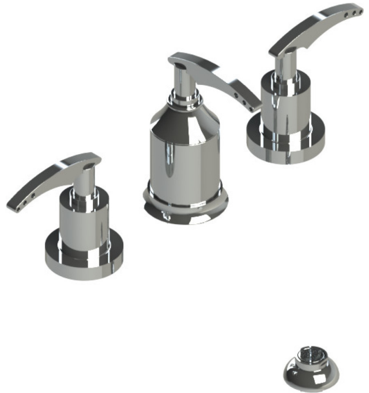
BIDET FITTING WITH SPRAY, DIVERTER, WITH VACUUM BREAKER (LESS DRAIN)