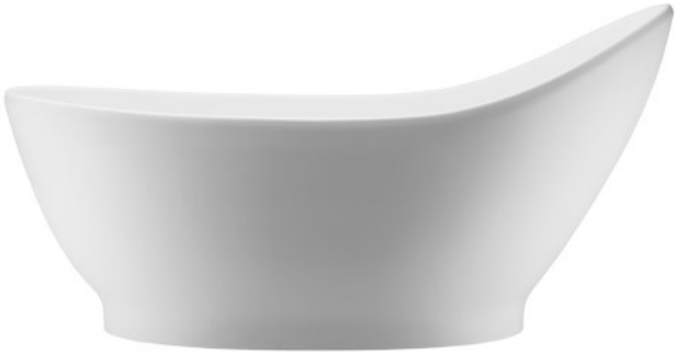
Features an integrated overflow.

NOTE: Filling this tub to the maximum may require an above average size or dedicated water heater.