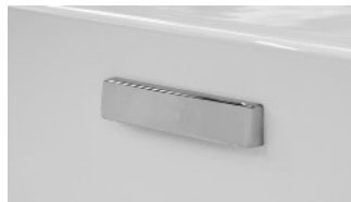
Rectangular overflow included

Slim-Line Overflow with Toe Tap Drain Solid Brass Drain Chrome (SLOTSBC) $930 Brushed Nickel (SLOTSBBN) $935 Polished Nickel (SLOTSBPN) $935 White (SLOTSBW) $965