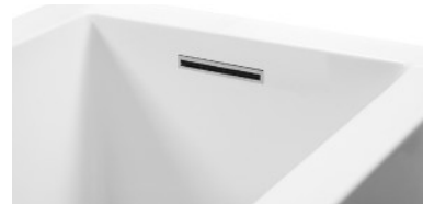
Optional Slim-Line overflow