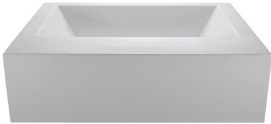
Available as a freestanding model or finished on 1, 2 or 3 sides for various installation applications.