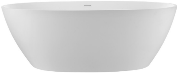
Shown above as soaking bath without pedestal