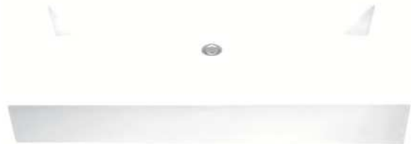
Wymara Double shown with drain cover removed.

Quick Ship/Priority. Call for availability.(QUISINKSH) $85