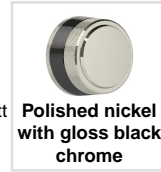
Polished nickel with gloss black chrome