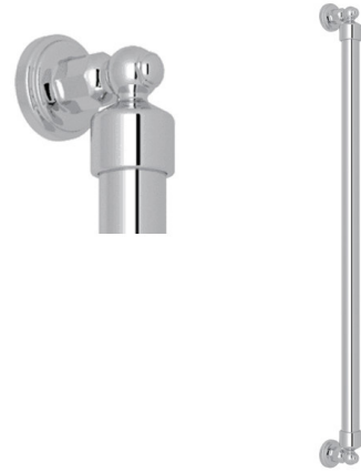
28" Grab Bar