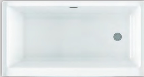
CITTI 6032 WITHOUT INSERT