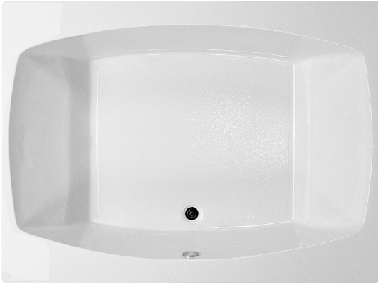
Features a textured bottom