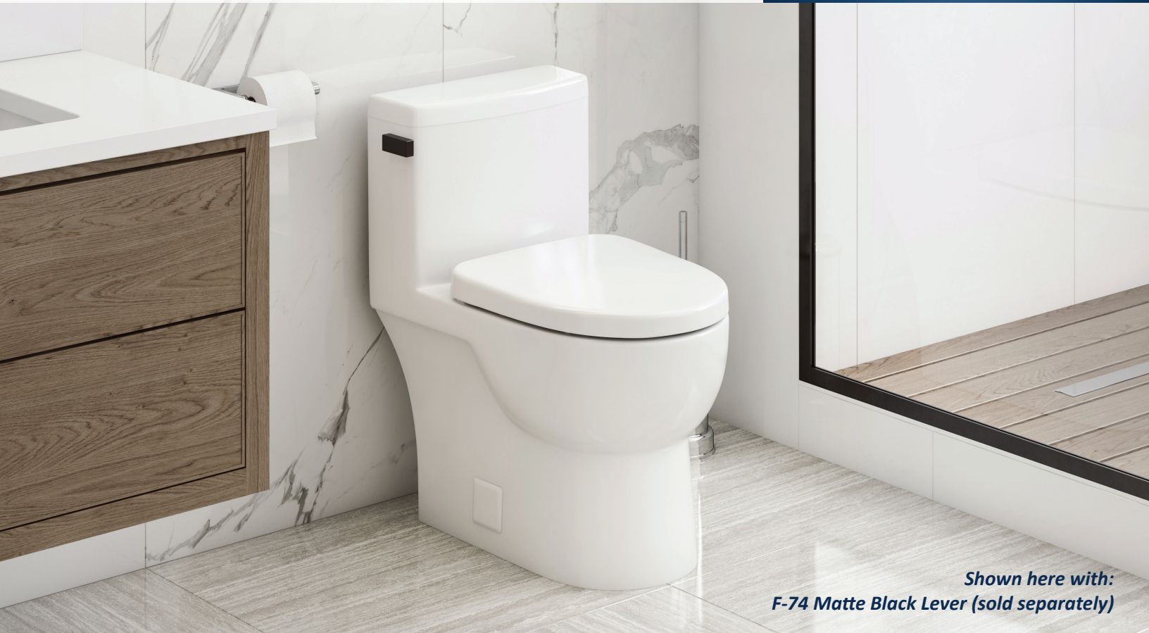
Shown here with: F-74 Matte Black Lever (sold separately)