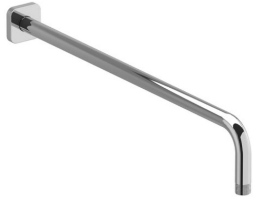
20" Reach Wall Mount Shower Arm With Square Escutcheon