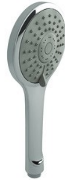
4" 3-Function Handshower