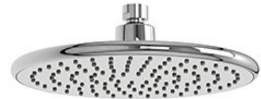
9" Rain Showerhead